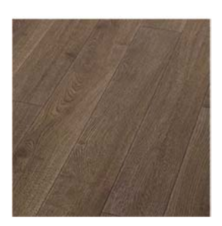
Martinez Oak A10003