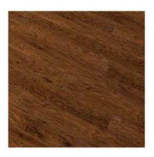
Brockton Hickory A10002