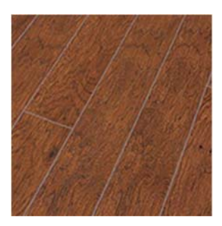
Cranston Hickory A10008