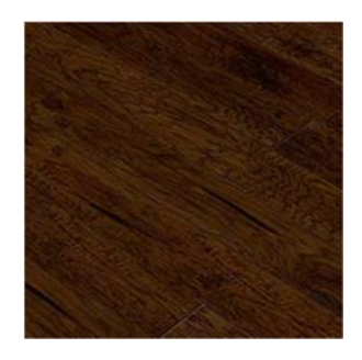
Charleston Hickory A10001