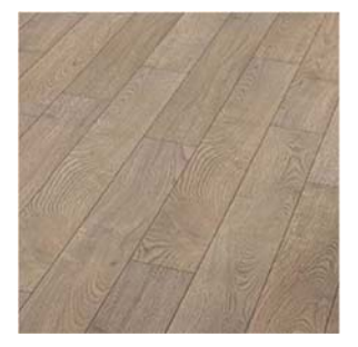
Providence Oak A10004