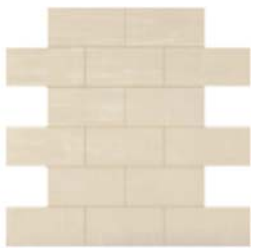
Off White SY95