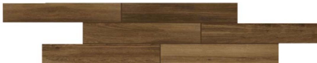
Walnut Creek SD15