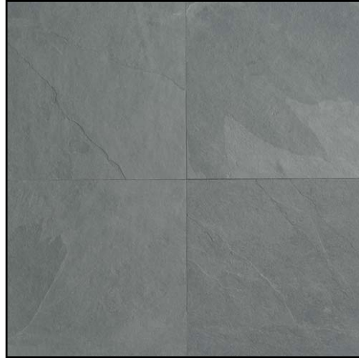
Brazil Grey S201