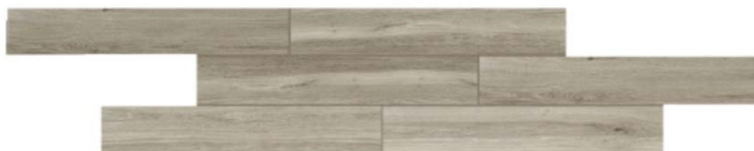
Gravel Road SD16