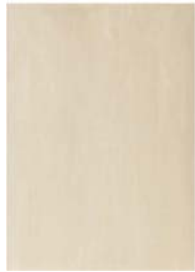
Off White SY95