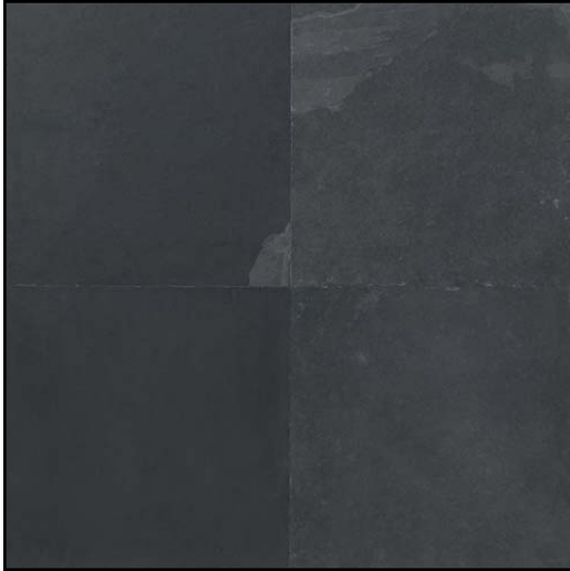
Brazil Black S762