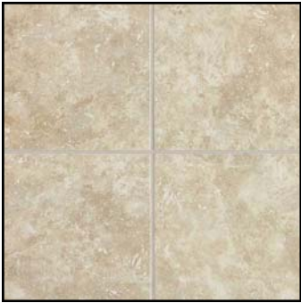
White Rock HL01