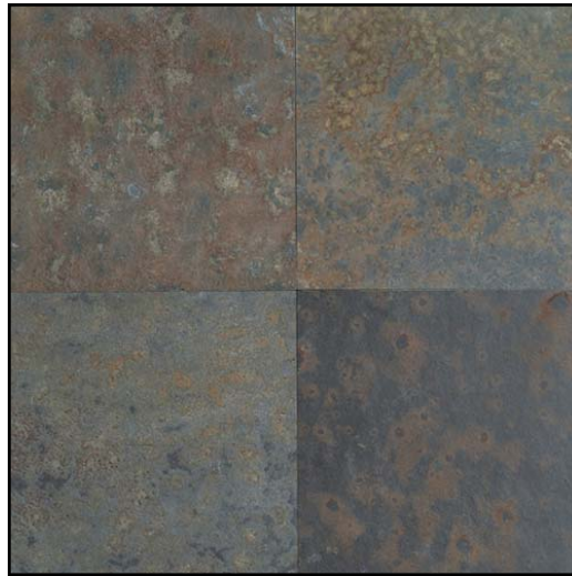
Brazil Multicolor S275

Due to variation in computer monitors and printers, the color samples seen here may not exactly match the corresponding color.